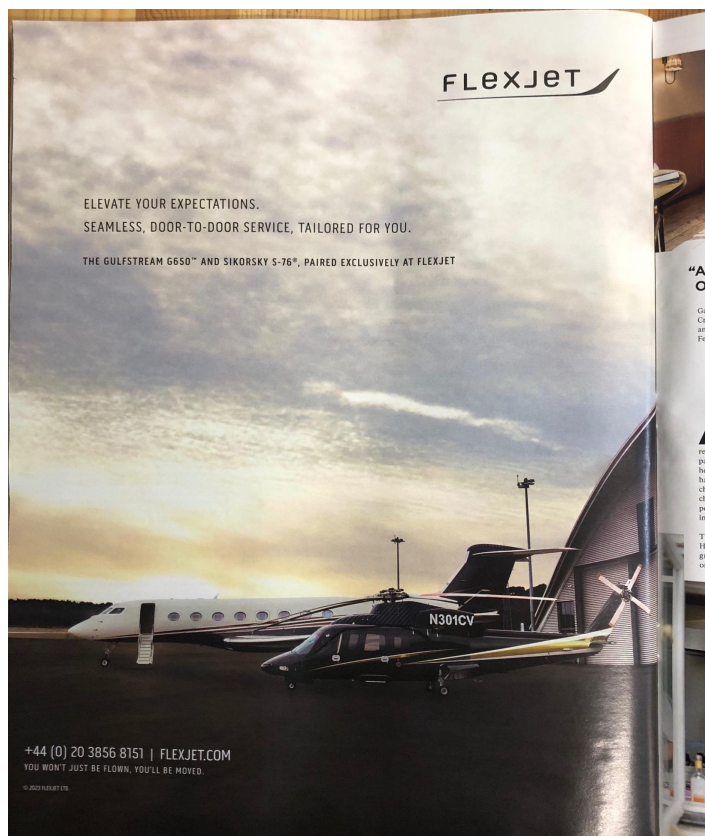
Caption: Private jet advert in the FT's How to Spend It , May 2023.